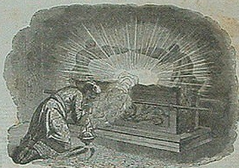
The Ark and Mercy Seat.—Exod. xxx. 10-26.